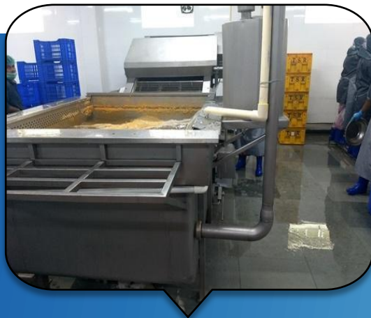
◆ Prawn Washer at Receiving Point