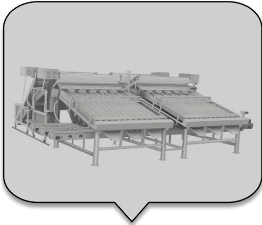
◆ Grading Machine with 1 MT capacity per hour