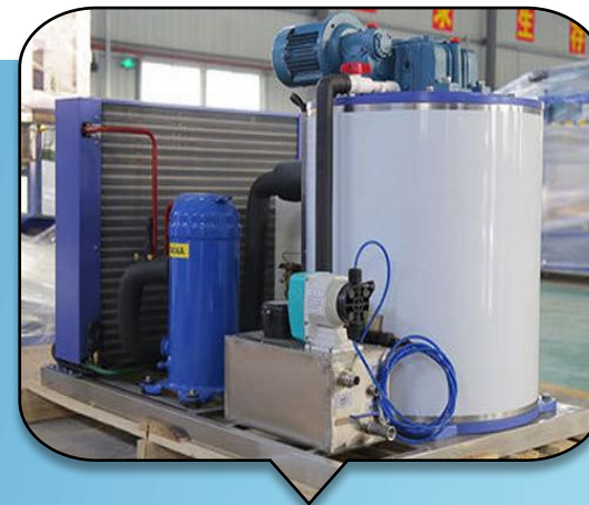
◆ Flake Ice Generators of 20 MTs per day