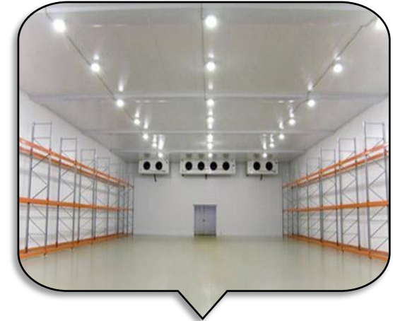
◆ Cold Storage capacity of 250 MTs